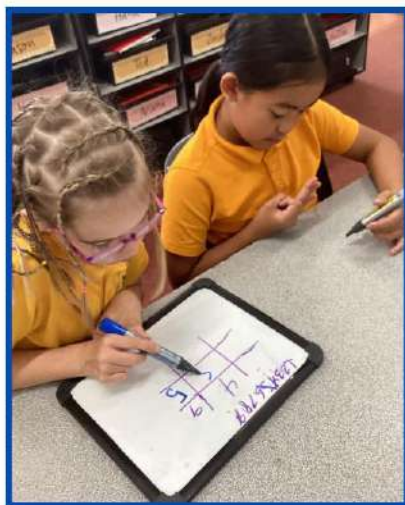
Year 3/4 students have been playing Tic Tac Toe in Maths to improve their number skills.