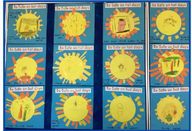
Foundation/One students have been exploring one of our 4B's. Be Safe. They have been learning about ways to stay safe on hot days.