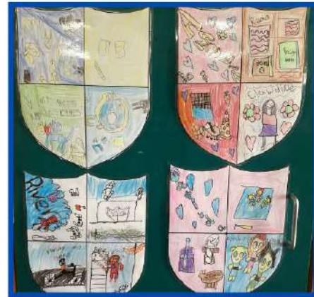
Year 2/3 students have each created their own Coat of Arms which includes information about themselves.