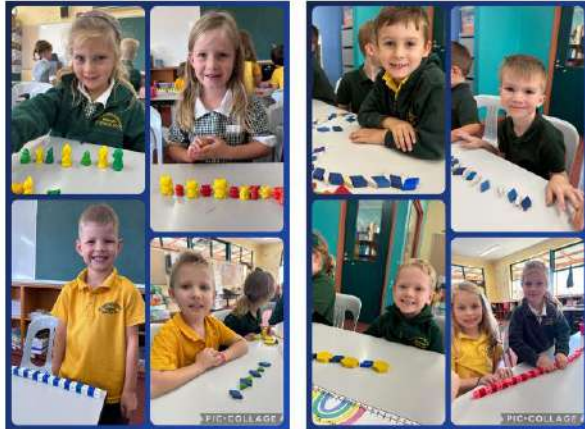
Foundation students have been learning about Patterns in Maths. They have been making and continuing patterns.