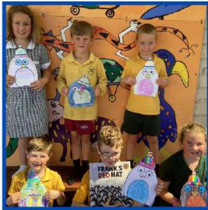
Year 1/2 Students read 'Frank's Red Hat' and shared their good ideas about what to do when you are feeling nervous.