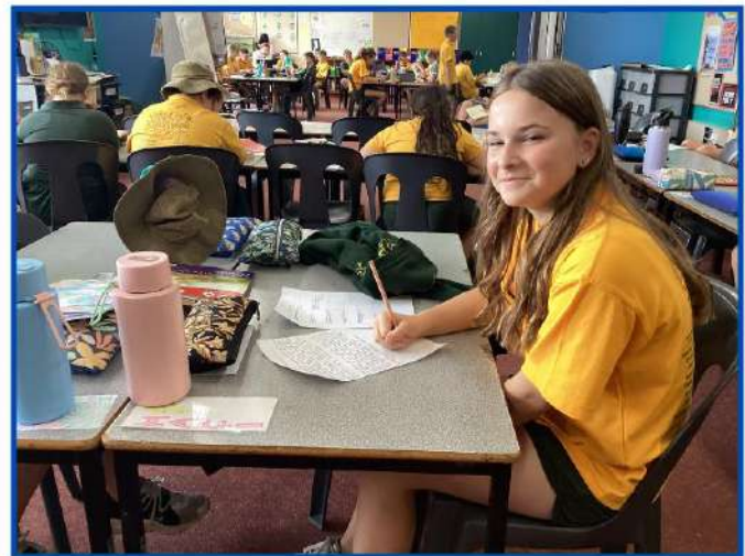
Year 5/6 students have been working on their vocab and editing skills during their recent Cold Write.