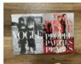
Vogue – Coffee table books