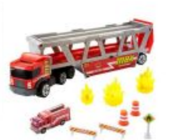
Matchbox Fire Rescue Hauler