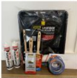
Painters Pack & $200 Hammond's Paints voucher