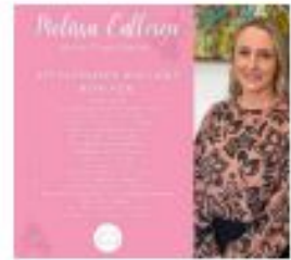
Bulk Billed - Women's health consult