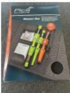
Builders Pencil Set