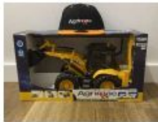
Bruder 1/16 Scale JCB 5CX Backhoe Loader