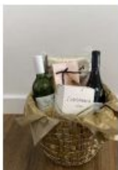
Wine and Candle Hampers