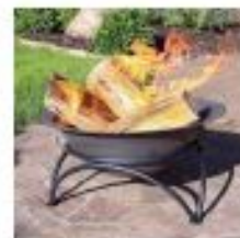
5m3 of seasoned Cyprus