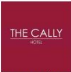
The Cally - $50 Voucher