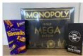
Family Games Night package