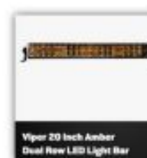
Light Bar - Bade Ness Rural