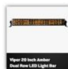
Light Bar - Bade Ness Rural