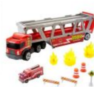
Matchbox Fire Rescue Hauler