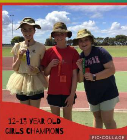
12-13 YEAR OLD GIRLS CHAMPIONS