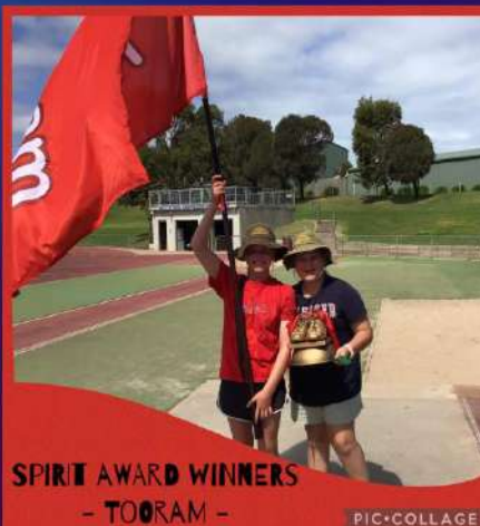
SPIRIT AWARD WINNERS - TOORAM -