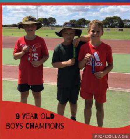
9 YEAR OLD BOYS CHAMPIONS