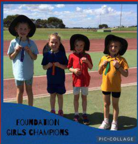
FOUNDATION GIRLS CHAMPIONS