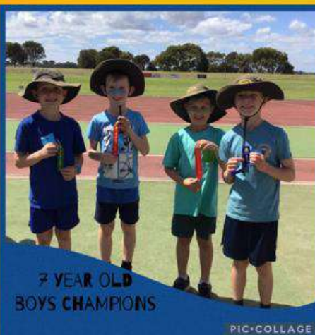
7 YEAR OLD BOYS CHAMPIONS