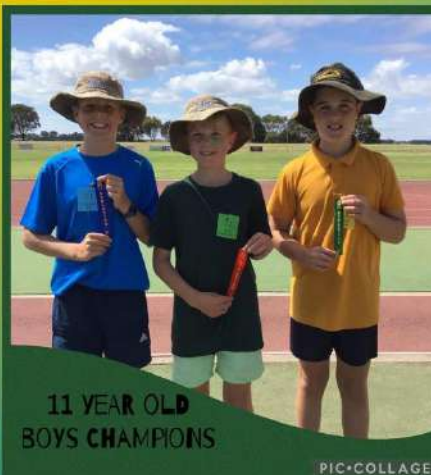
11 YEAR OLD BOYS CHAMPIONS