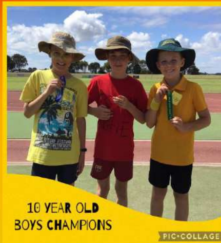
10 YEAR OLD BOYS CHAMPIONS