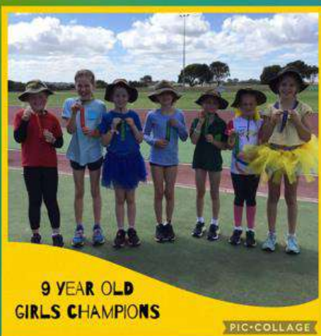
9 YEAR OLD GIRLS CHAMPIONS