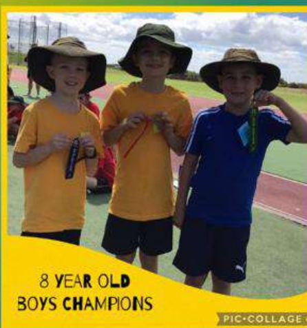
8 YEAR OLD BOYS CHAMPIONS