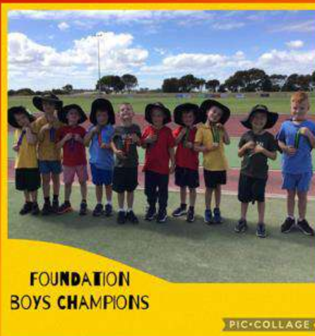
FOUNDATION BOYS CHAMPIONS