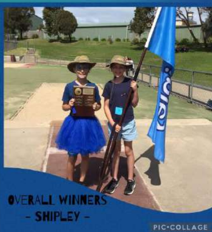
OVERALL WINNERS - SHIPLEY -