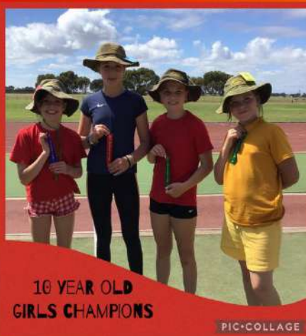
10 YEAR OLD GIRLS CHAMPIONS