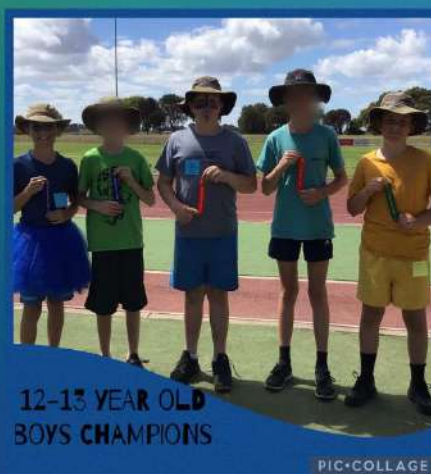
12-13 YEAR OLD BOYS CHAMPIONS