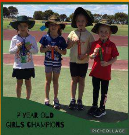
7 YEAR OLD GIRLS CHAMPIONS