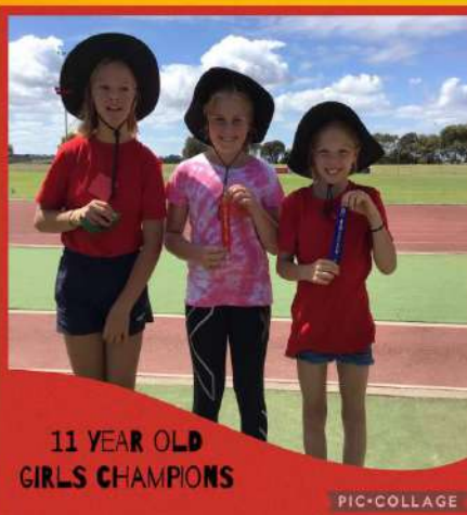
11 YEAR OLD GIRLS CHAMPIONS