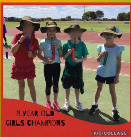
8 YEAR OLD GIRLS CHAMPIONS