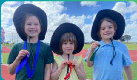
FOUNDATION GIRLS 2023