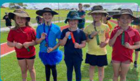
8 YEAR OLD GIRLS 2023