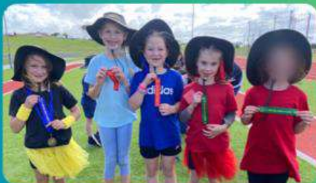
7 YEAR OLD GIRLS 2023