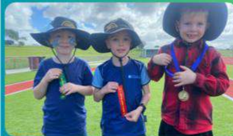
FOUNDATION BOYS 2023