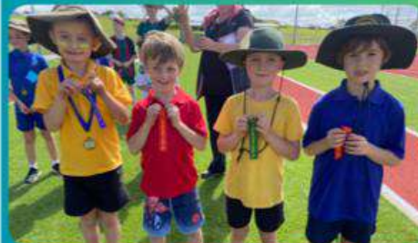
7 YEAR OLD BOYS 2023