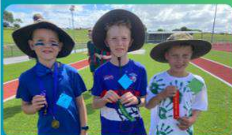
8 YEAR OLD BOYS 2023